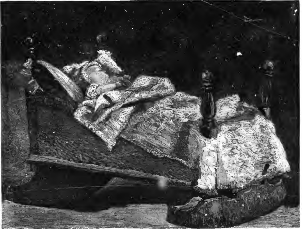
A YOUNG PILGRIM IN AN OLD CRADLE.

Our Canadian Mecca has an authentic date